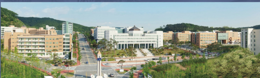
Dankook University JUKJEON Campus